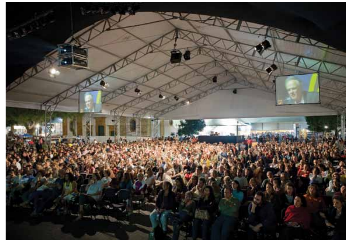
In the Giant Screen Marquee, FLIP's events are beamed live to an audience of up to 1.400. Events are also broadcast in real time via the internet.