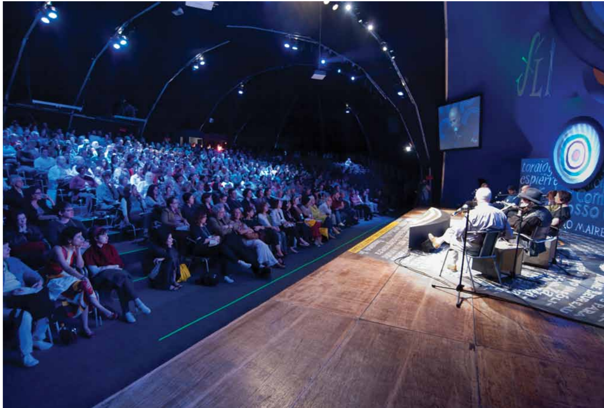
Some 34.000 tickets were sold for events and panels in 2009. The Authors' Marquee can hold up to 850 spectators.