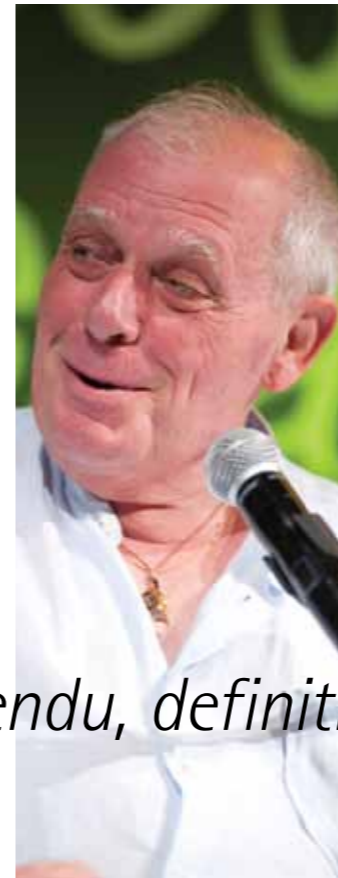
António Lobo Antunes