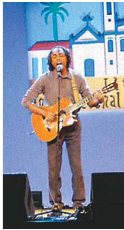
Legendary Brazilian musicians welcome FLIP's guests.